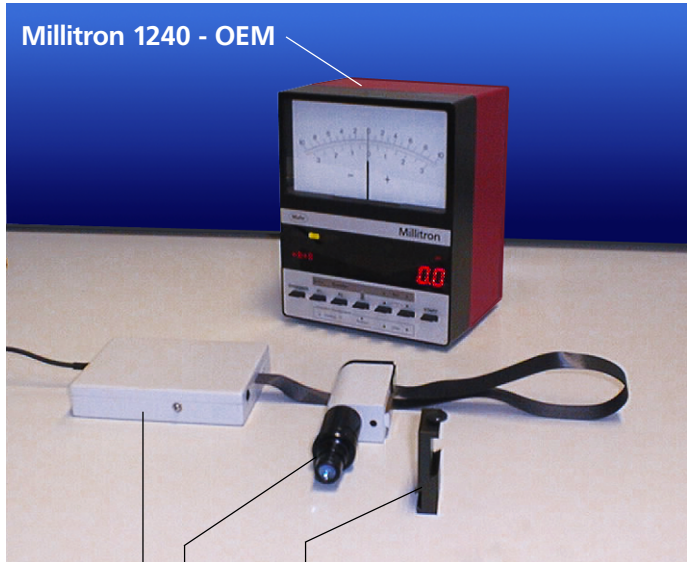
Millitron 1240 - OEM